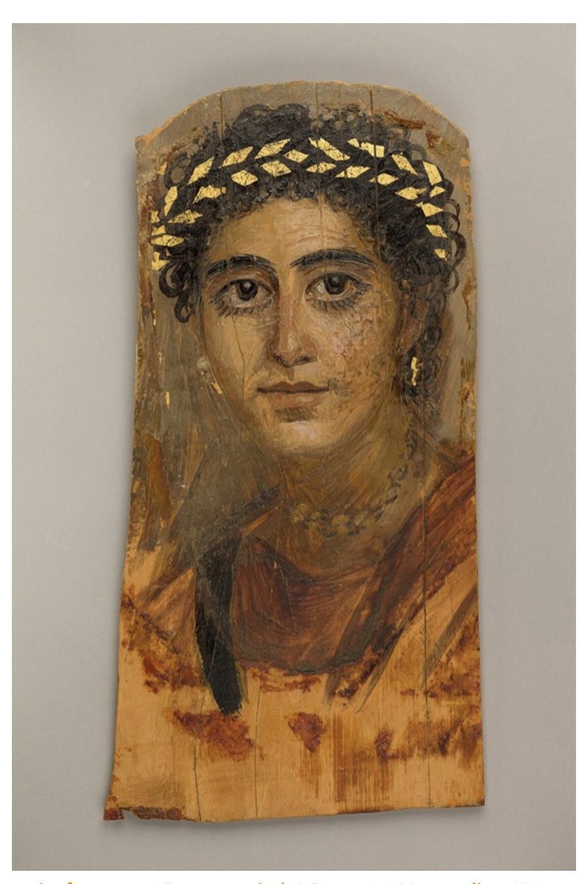
Portrait of a woman, Roman period, A.D. 90-120, Metropolitan Museum of Art

"I commend to you our sister Phoebe, a deacon of the church at Cenchreae, so that you may welcome her in the Lord" - Romans 16:1-2a (NRSV)