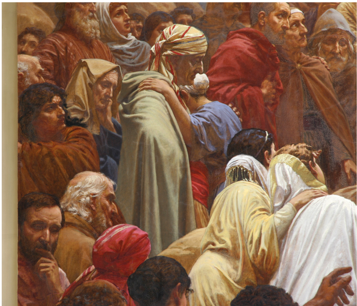
This 2007 painting is a portion of a larger work which hangs over the altar of St. Matthew's Church in Copenhagen. The people are listening thoughtfully to Jesus' teaching.