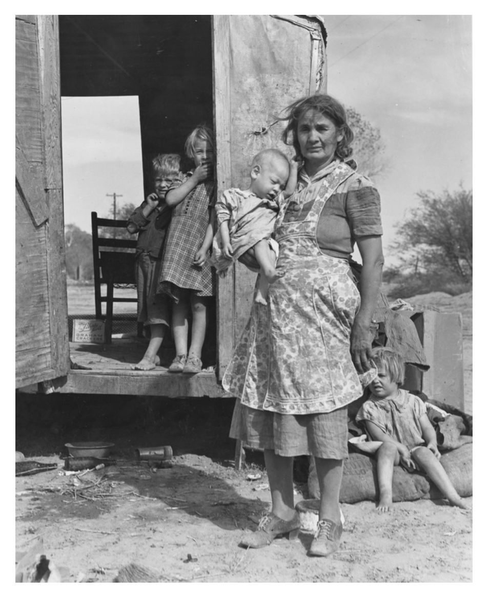
This 1940 photograph shows an impoverished migratory family in their trailer in an open field in Arizona without sanitation or water.

"For all those who exalt themselves will be humbled, and those who humble themselves will be exalted."~ Luke 14:11 (NRSV)