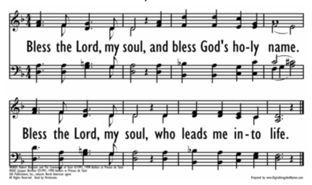
Reprinted under Onelicense.net #A-707825.