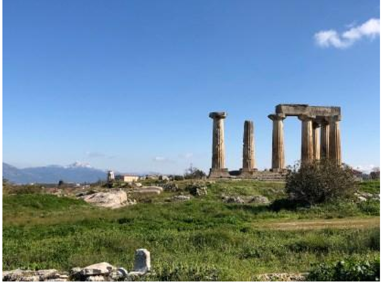
Temple of Apollo at Corinth