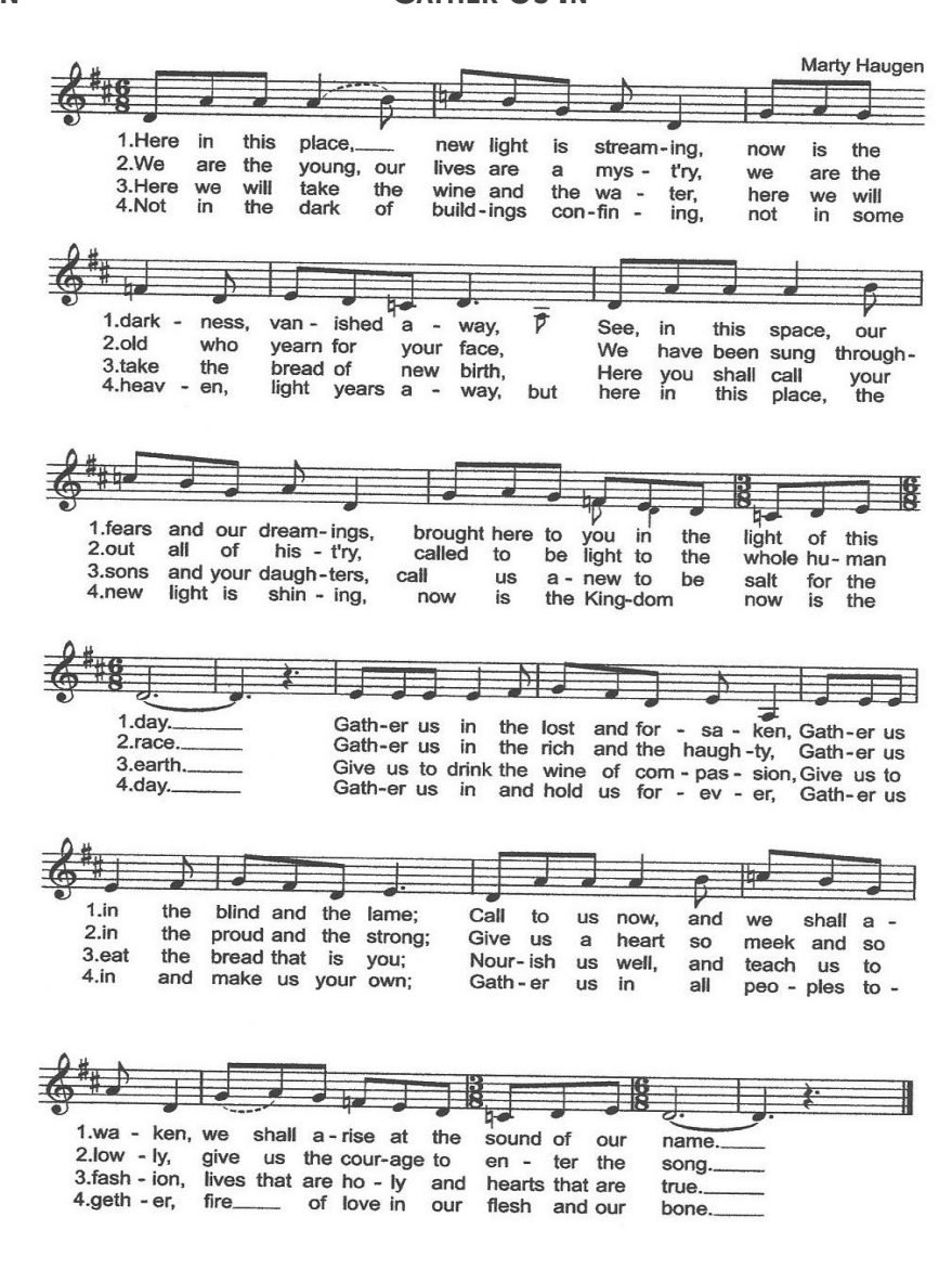
Verses 1 & 2

© 1982, GIA Publications, Inc. All rights reserved. Used with permission.